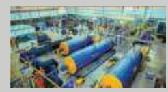
Second retread plant in Arusha