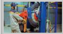
Third retread plant in Mwanza